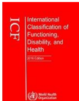
International Classification of Functioning, Disability and Health (ICF)