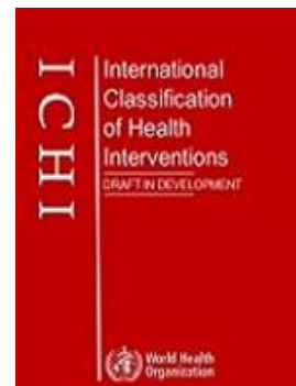
International Classification of Health Interventions (ICHI)

The WHO-FIC Collaborating Centre for the African region is hosted by the South African Medical Research Council in Cape Town, South Africa. The Centre supports the development, implementation and maintenance of WHO-FIC across the region, and through the global WHO-FIC Network .